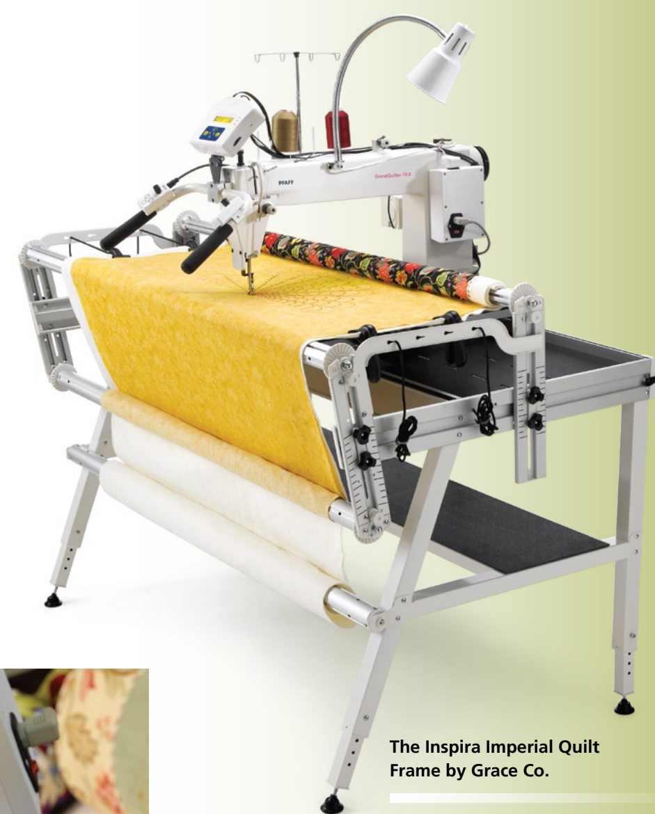
The Inspira Imperial Quilt Frame by Grace Co.

You will enjoy the frame's full-featured carriage as it enhances your control and ease-of-movement along the track. The Imperial Frame, with its 2" Professional Series Rails and including the Fabri-Fast™ system is perfect for your PFAFF® GrandQuilter 18.8™.