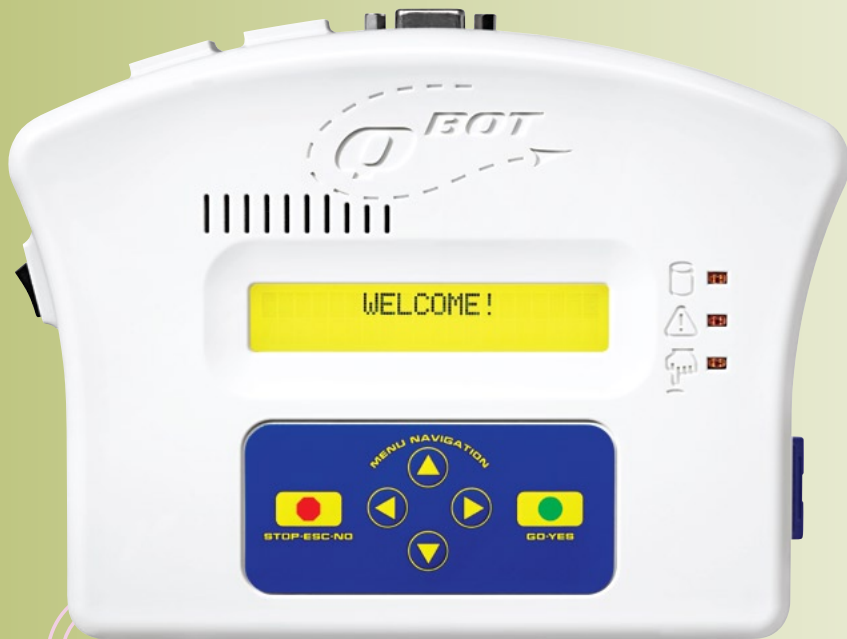
QBOT™ by Inspira