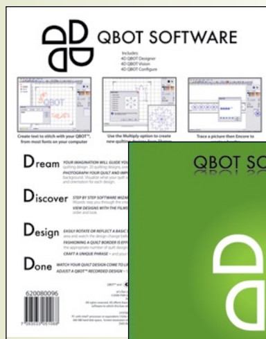
QBOT™ Software by Inspira